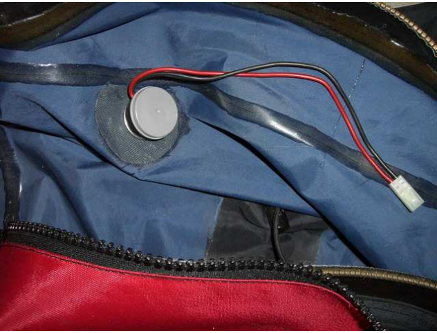
Inside the suit is a old filmbox on it also the 2<sup>nd</sup> layer for protection under the connector is selfmade