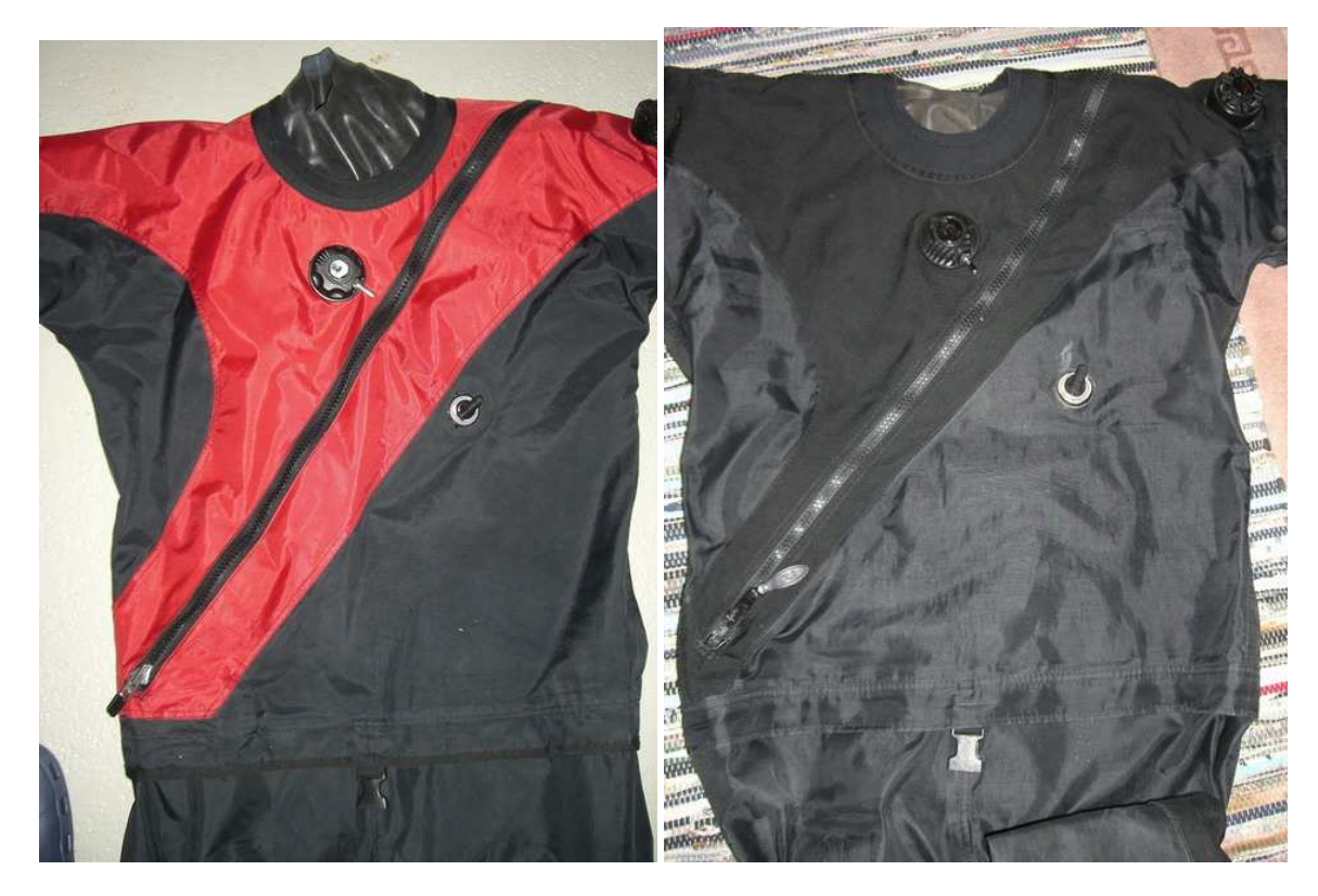
Gravity Zero Suit in red-black with SubSea Heatingconnector + DIR-Zone Pee-Valve on the right femoral, SiTec Valves