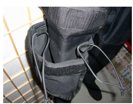
the pockets on the GZ suit have two bungeeloops, but the second. one (here on the pic the are self made