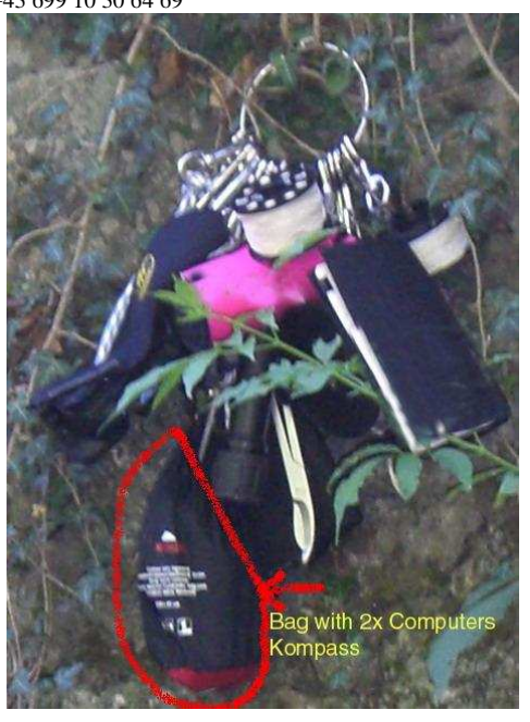
some Equipment, Spool, Mask etc. McKinley Bag with the Computers inside