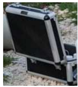
this is the RB-Sparepartbox