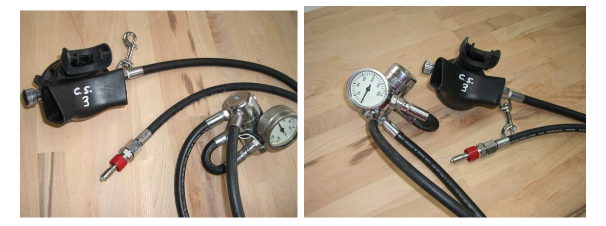
each Stage Regulator had 2x 100cm LP Hose, one with the 2<sup>nd</sup> Stage and one with the Swagelok Connector