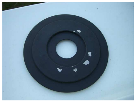
triggerplate from RB80 with unique defect coat