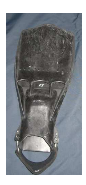
DiveSystem Finns incl. springstraps Also without Logo on the straps

If you see ore know some parts on the list, pleases contact me \frac{clemenzo@dir-austria.com}{+43~699~10~30~64~69} ore