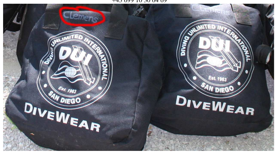
DUI bags are marked with white "Clemens" on bouth side in the top, one DiveWare and one Drysuit (not on the pic)