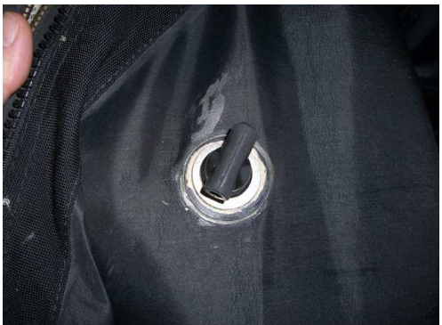
Heating connector on the DUI suit