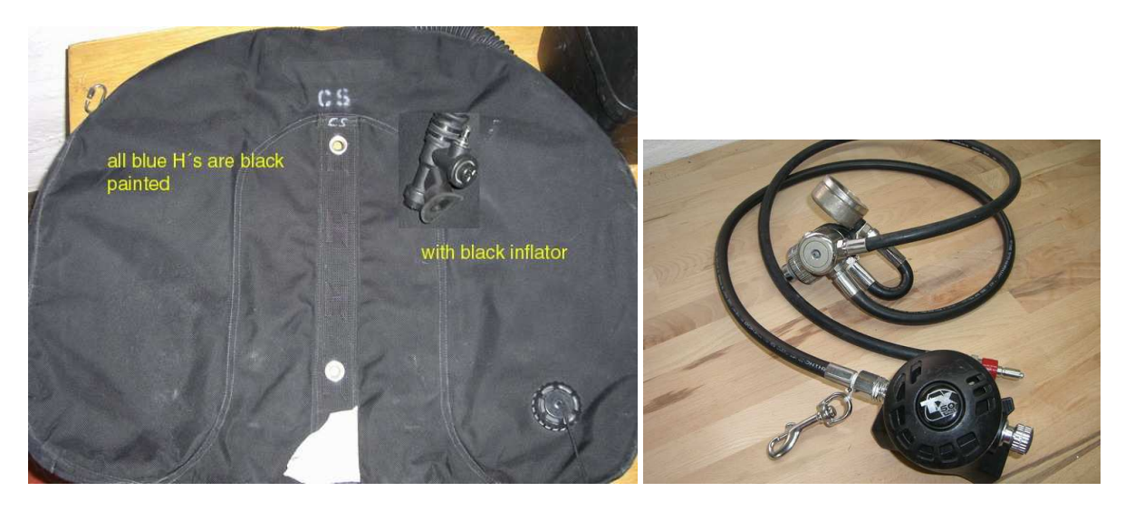
no Halcyon Logo on the 55lbs Wing