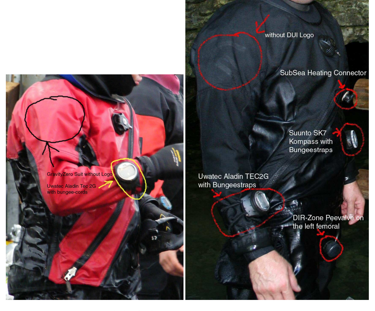
both Suit's have NO Logo/Brand on it