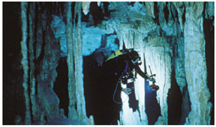
Pinpoint buoyancy control and modified fin kicks are two important safety skills for cave and cavern divers.

Buoyancy and anti-silt techniques that keep cave and cavern divers floating above trouble.